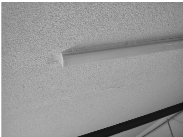
A sample showing from where the Whisper Coat has fallen

At the vote, "A" was moved, seconded and agreed.